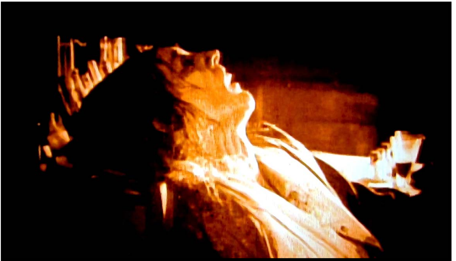
Dr. Jekyll and Mr. Hyde (1920 film)