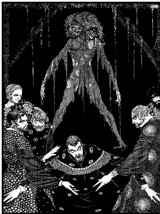
Illustration by Harry Clarke