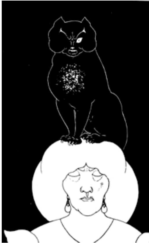
Illustration by Aubrey Beardsley