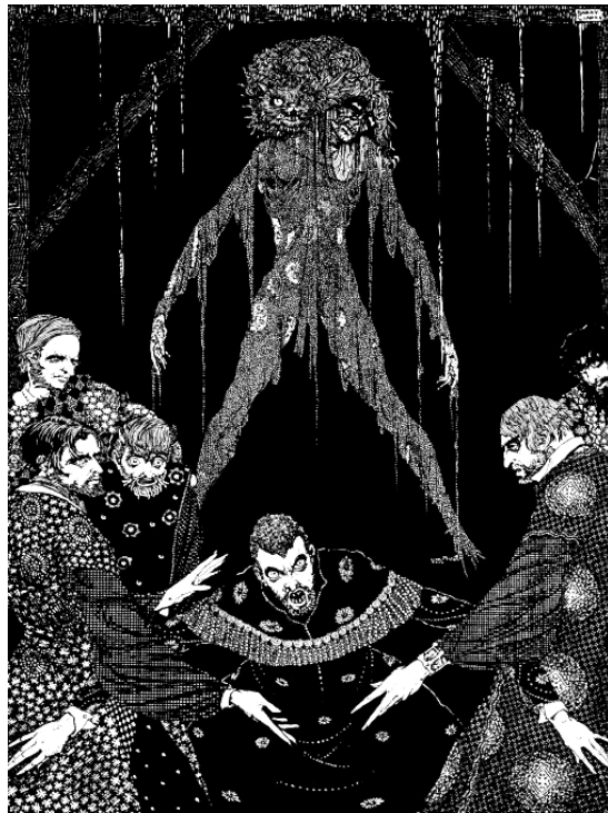
Illustration by Harry Clarke