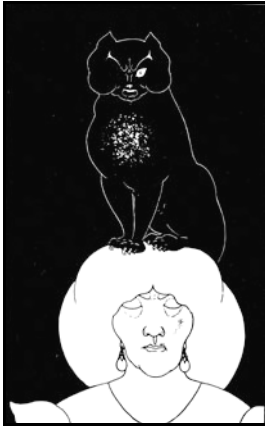
Illustration by Aubrey Beardsley