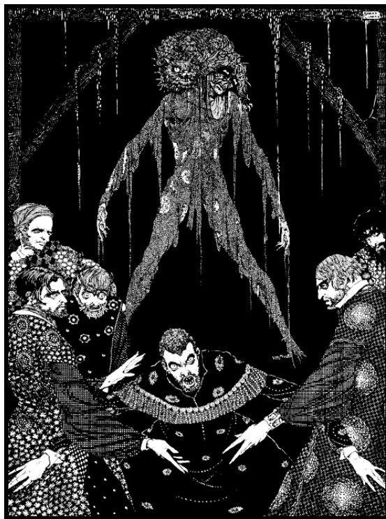
Illustration by Harry Clarke